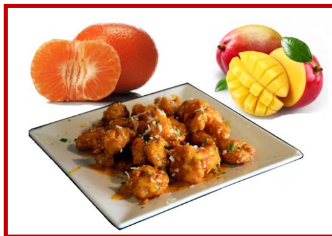
Battered Chicken & Mandarin Mango Sauce